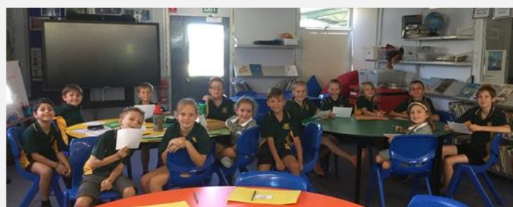
Our new meeting location in the Library

Week 3 12 - 16 February Thursday - Assembly SRC/Yr 2/3 8.55am Week 4 19 - 23 February Monday - Governing Council 7 pm Friday - SAPSASA Swimming Renmark Week 5 26 February - 2 March Thursday - Assembly Rec / Yr 4/5 Friday - Tennis Carnival Berri, Yr 3 - 4 Week 6 5 - 9 March Monday - Swimming Yr 3, 4 and 5 Friday - Student Free Day - Moderation Week 7 12 - 16 March Monday - Adelaide Cup Day Thursday - Assembly Yr 1/2, Yr 5/5 Week 8 19 - 23 March Monday - Governing Council 7 pm