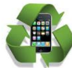
Mobile Phone Recycling

Our class are also collecting old mobile phones (with battery removed). Mobile Phones contain coltan, a space-age metal that has allowed devices to become even smaller, that can be recycled, saving habitat and illegal mining of the minerals.